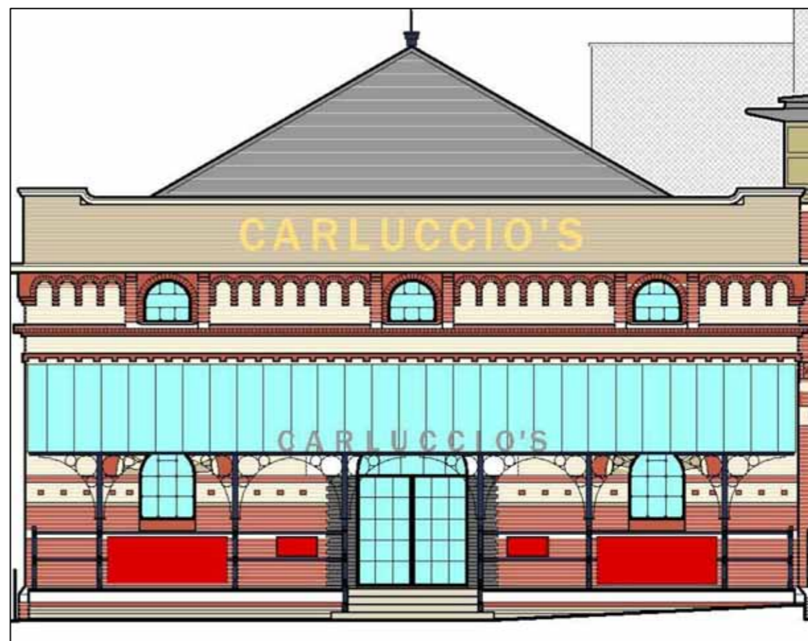
Context: South Elevation 1:100 Scales print @ A3 'Version 2 03-07-12'