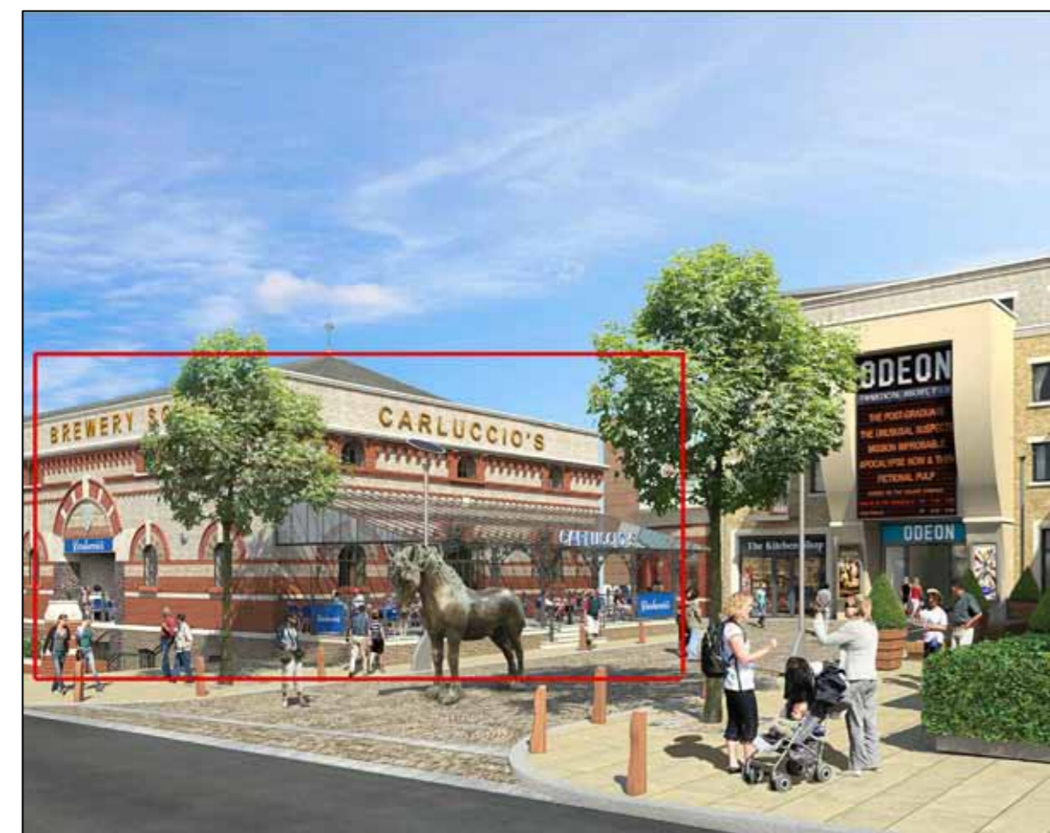
No 1 Dray Horse Yard